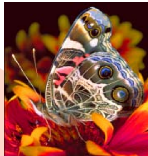
American painted lady